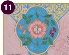
11 Needlework Guild's Choice Design Portfolio