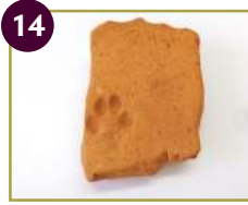
14 140 Winner Roman Cat Print Brick