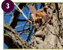
3 Head Gardener's Choice 'Treebeck'