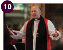
10 Bishop's Choice A Life in Ministry