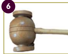
6 SMCA's Choice Auctioneer's Gavel