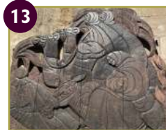
13 Chief Steward's Choice The Flight to Egypt