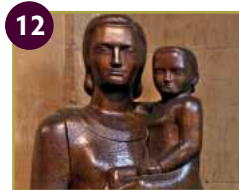
12 Canon's Choice The Kelham Madonna