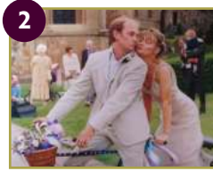
2 Community Choice A Bicycle Made for Two