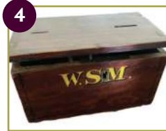
4 Dean's Choice Chorister's Christmas Box