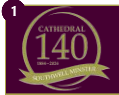
1 Your Choice Cast your vote here!