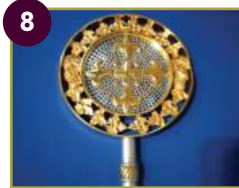
8 Vergers' Choice William's Verge