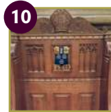
The Seat of the Bishop (Cathedra)