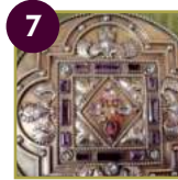
Mitre and Morse