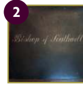
The Bishop of Southwell's Case