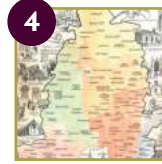
Map of the Diocese