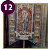
1884 Embroidered Banner