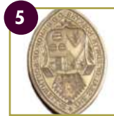
Seals of Southwell