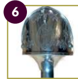
Bishop's Mitre Verge