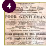
4 Southwell Theatre Playbill