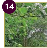
14 Bramley Apple Tree