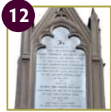
12 Becher and the Story of the Workhouse