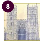
8 Closed for Business: The Restoration of Southwell Minster