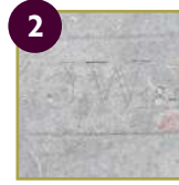
2 1842 Roof Tile