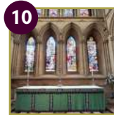
10 Gally Knight Windows