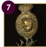
7 King's Messenger Badge