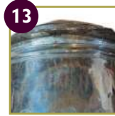
13 Mompesson of Eyam's Flagon