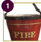
1 A Flash of Lightning on Guy Fawkes Night