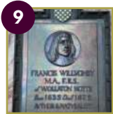
9 Willoughby of Wollaton Hall