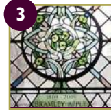
3 Bramley Apple Window