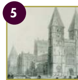
5 Thomas Girtin Watercolour