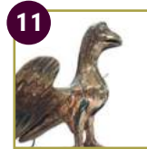
11 The Newstead Abbey Lectern