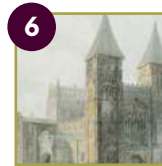
6 Southwell Minster Watercolour