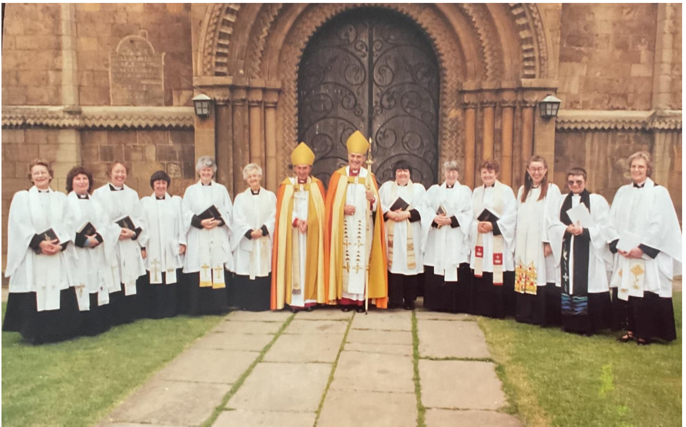
The first women to be ordained to the office of Priest in Southwell Minster, Sunday 29 May 1994

Once the ministers and choir have departed, you are invited to sit to listen quietly to the organ voluntary. If you wish to leave at this point, please do so without disturbing those who may still wish to listen or pray. The clergy will stand in the Crossing to greet you on your way out.