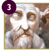
Memorial to Archbishop Edwin Sandys