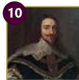
Portrait of Charles I