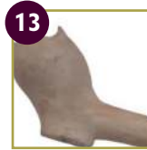
Clay Tobacco Pipe