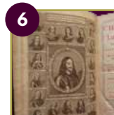
A Chronicle of the Late Intestine War