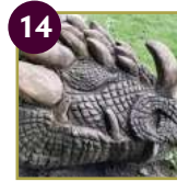
Oskytel the Dragon