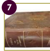
Geneva (Breeches) Bible