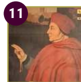
Portrait of Cardinal Wolsey