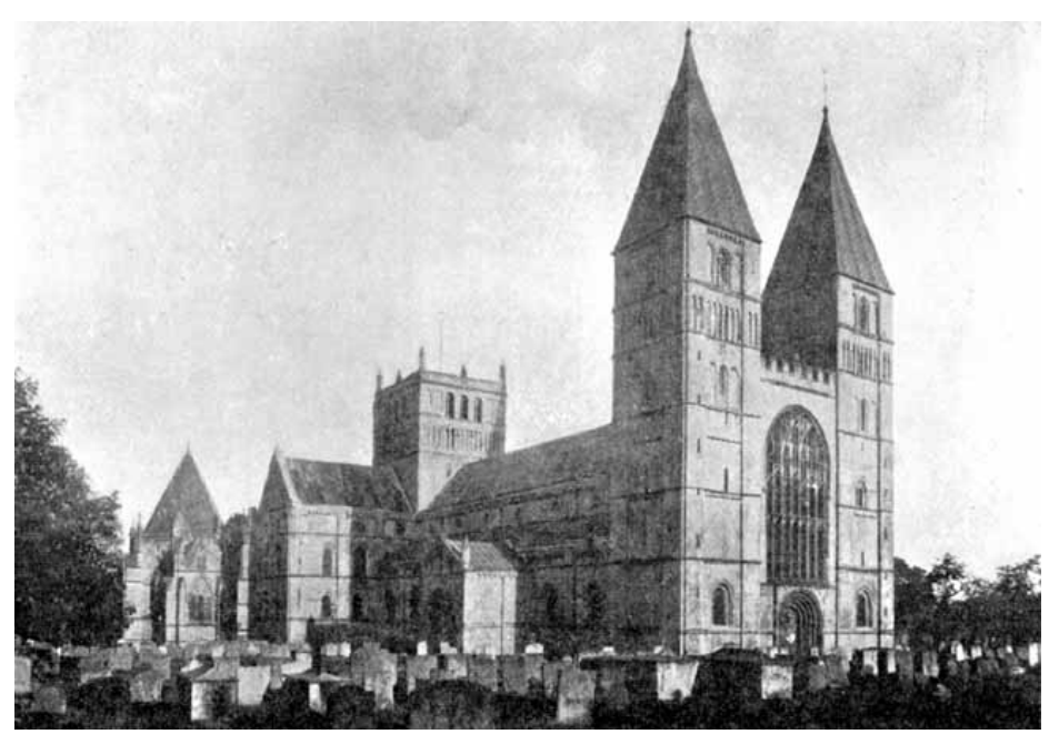
Southwell Cathedral from North-West.