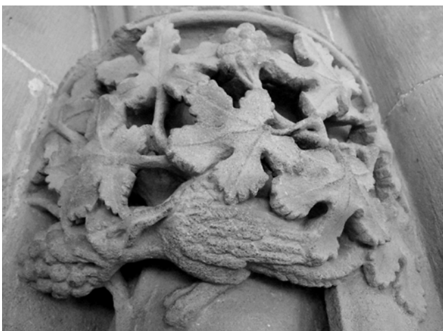
Left: A mythical creature, part lizard, part bird, eating the grapes on a vine.