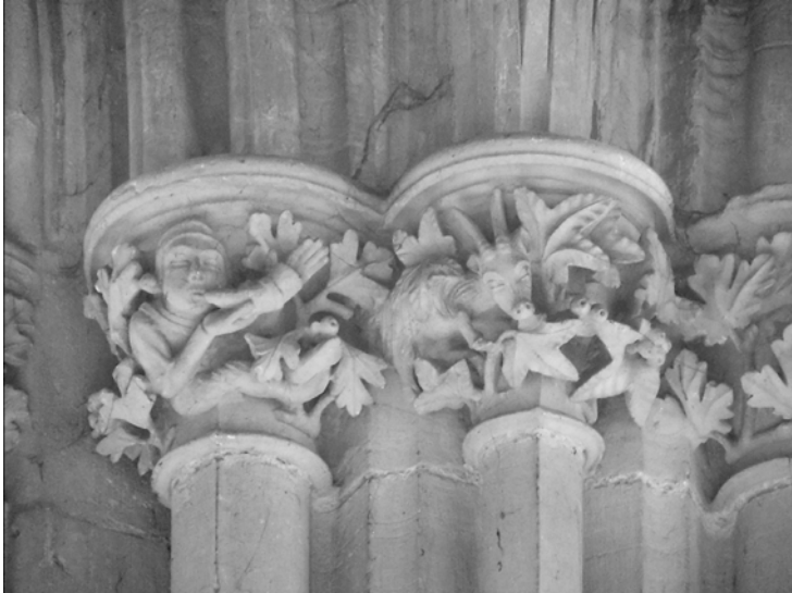
Left: High up between two windows on the north side. The Goat herd calling his goats with his horn and one of the flock, busy chewing foliage, is ignoring the call of his master.