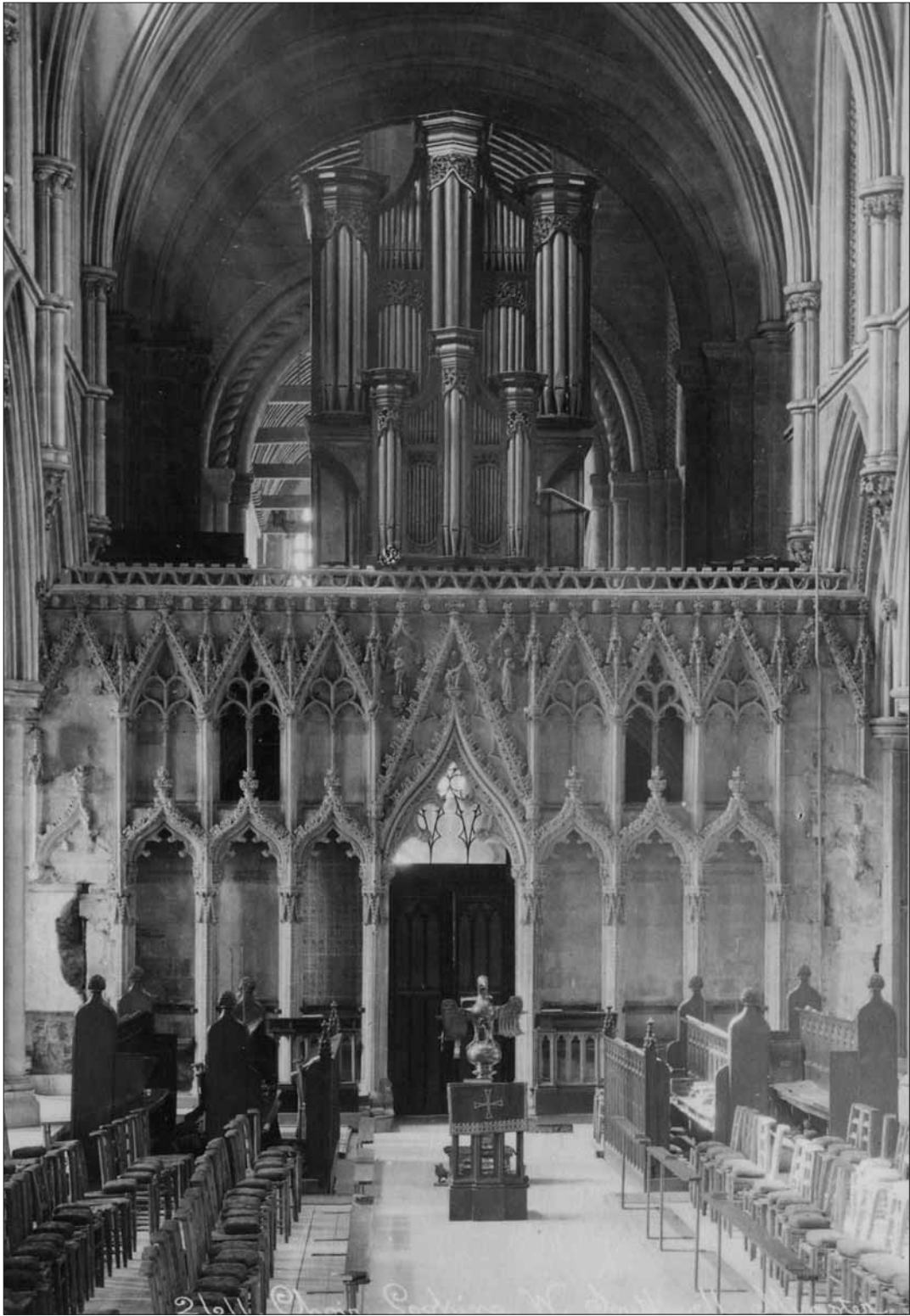
The Smith case viewed from the quire (1880s) — note the curious wind-trunk (?) to the Chaire case