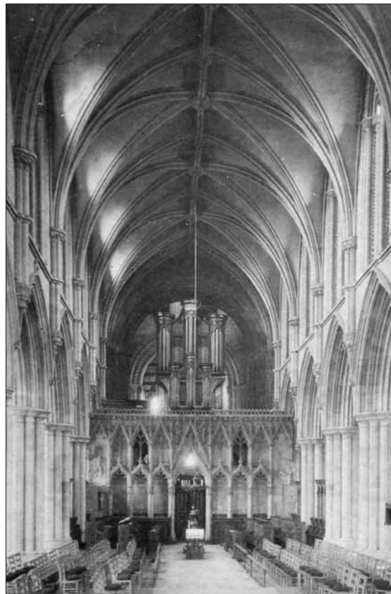
A mid-nineteenth-century view from the quire