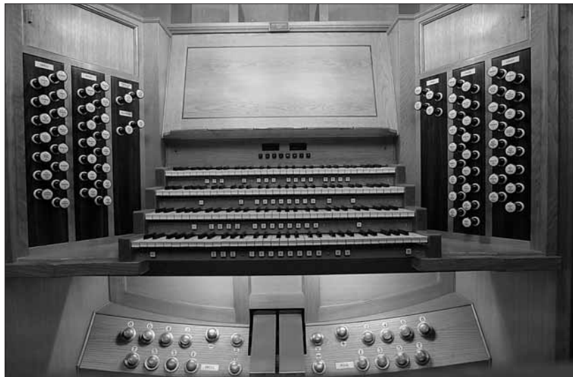
The console of the 1996 Nicholson quire organ