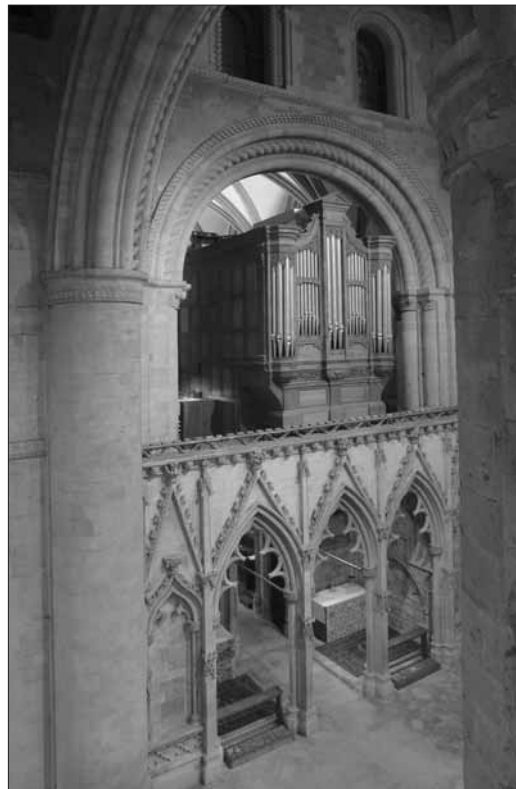
The screen viewed from the north nave triforium (photograph 2007)

Wagner Prelude 'Die Meistersinger' Bach 'An Wasserflüssen Babylon', Toccata, Adagio and Fugue in C Schumann Fugue No 3 on BACH Naji Hakim Variations on Two Themes Whitlock Sonata in C minor Daniel Roth Final 'Te Deum'