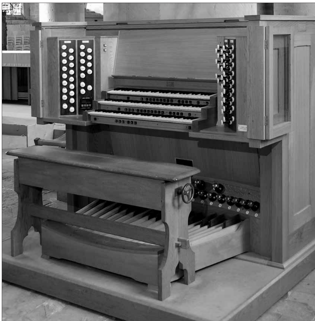
The Wood 1992 nave console