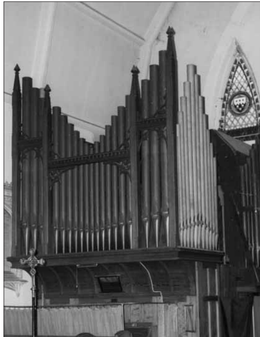
The John Nicholson organ (1868) in St Peter's church, Malvern Wells

Initial plans had already been approved by the Cathedrals Advisory Committee and in 1992 the nave organ was built, paid for from Minster resources. Meanwhile the screen organ scheme was still under development and was not finally taken to the new body, the Cathedrals Fabric Commission for England, until 23 March 1995. During 1994, plans with Nicholson had been refined and almost finalised, but the cost was still a worrying factor when it became clear that the Appeal would probably not raise the £250,000 needed to augment the Minster's Organ Fund. In December 1994 I was told of a fine old Nicholson organ in St Peter's Church, Malvern Wells, which had just been closed. Nicholson assured me that it had just the tone we were after, and so we considered buying it and using its pipework as the basis of an otherwise new instrument.