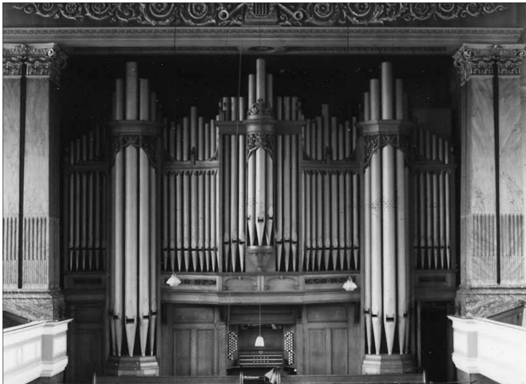
The J J Binns organ (1904) in Heckmondwike Upper Independent Chapel, West Yorkshire