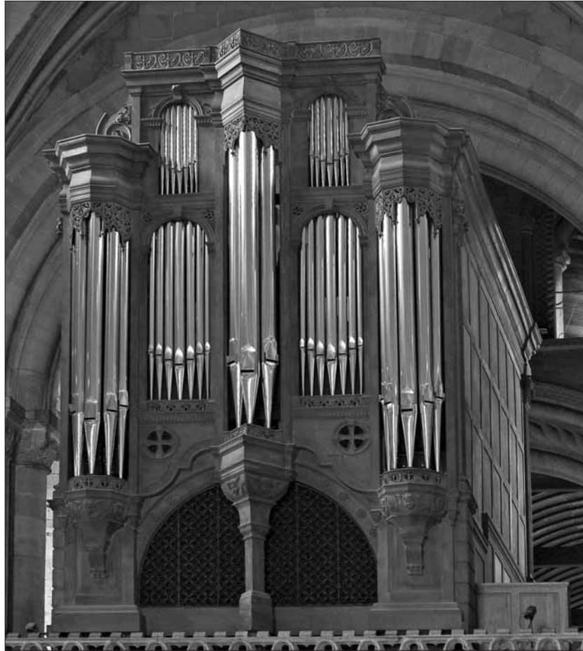
The quire case-front showing the tin display pipes of the Great Small Open Diapason (photograph 1996)