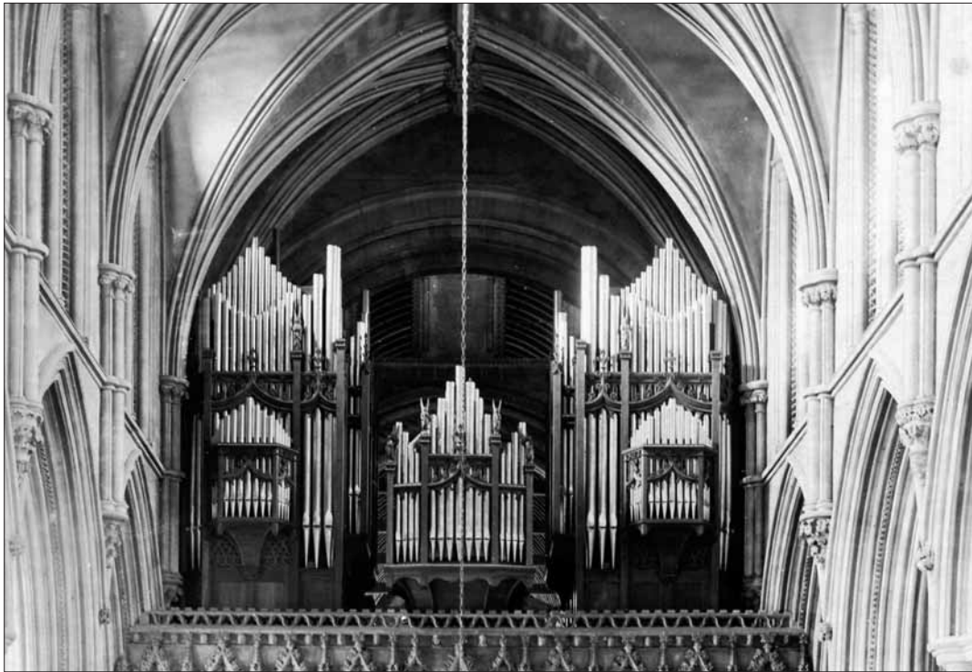
The Bishop case, viewed from the quire (after 1892)